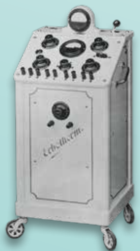
1923: Erbotherm 900 HC

The VIO® 3, with the latest technology upgrades and enhancements, stands proud as the newest generation in the VIO® series.