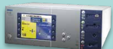
2002: VIO® 300 D 1.x