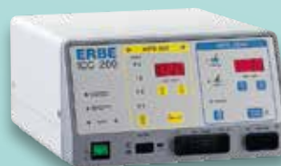
1992: ICC 200 E