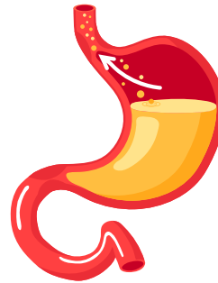
Gastroesophageal reflux disease